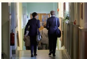
The best performing schools in Greater Manchester - use our gadget to find out where your child's school ranks

I read an article a few weeks ago in the Manchester Evening News regarding the top 20 schools in Great Manchester . In the category of the top 20 schools for Grade 5 or above in English and Maths, St Damian's was rated the 11 th best school in Greater Manchester . WOW! Click here . If you look at the names of the schools on the list, the top 7 schools are grammar schools. For St Damian's to be recognised and in such good company, really shows the high quality of teaching within the English and Maths departments. In fact, this high-quality teaching is replicated across the school. I am very proud of all the teachers who work tirelessly to ensure that your child leaves this school with the best possible opportunities for their future.